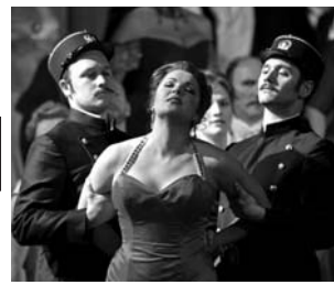
Photo: Anna Netrebko in Manon