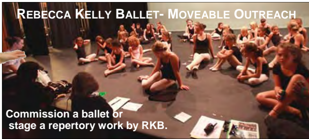
Commission a ballet or stage a repertory work by RKB.